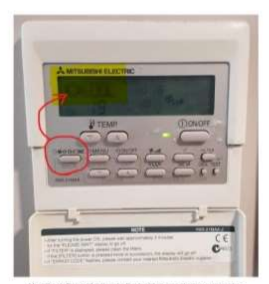
Use the leftmost button indicated to swap between modes

While each room has its own air conditioner unit, the centralised air conditioning system determines when it is on "Cool" or "Heat" mode. Once the system has been switched to either Cool or Heat it will not work effectively in the other mode in your room. Trying to override the system will damage the system and impacts the effectiveness of the system for the people in the rooms around you. We generally switch over once in the winter to Heat and once in the summer to Cool. The weekly newsletter and signs around the building will inform you when this is happening.